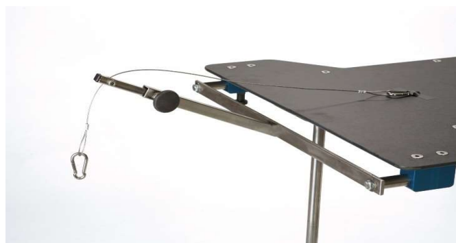
Horizontal Traction Tower, 18 Inches, Solid Stainless Steel Construction

Adapts Easily to End of Arm Table, 3/4" Outside Diameter Square