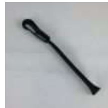
Large Finger Trap