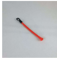
Small Finger Trap