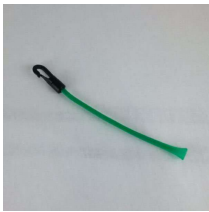
Extra Small Finger Trap

TW Surgical Finger Traps: TW Surgical offers all sizes of Finger Traps to meet your surgical needs. To view additional Finger Trap sizes as follows: