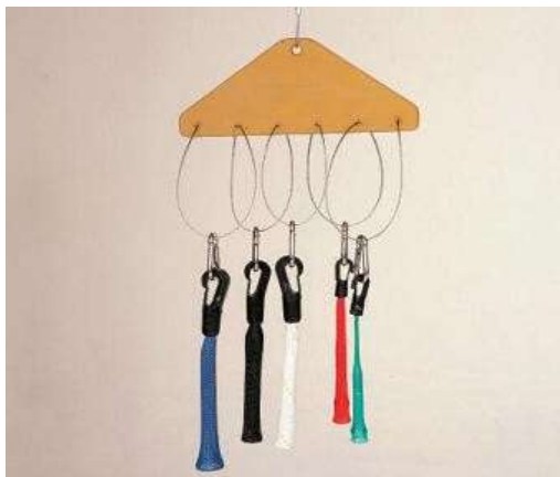
Triangle Traction Plate Device

Device can be used with IV poles or other extremity systems.