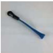
Extra Large Finger Trap