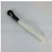
Medium Finger Trap